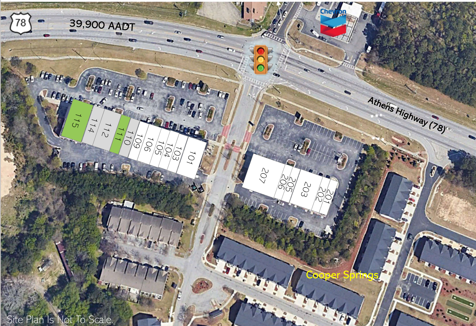
Site Plan Is Not To Scale.